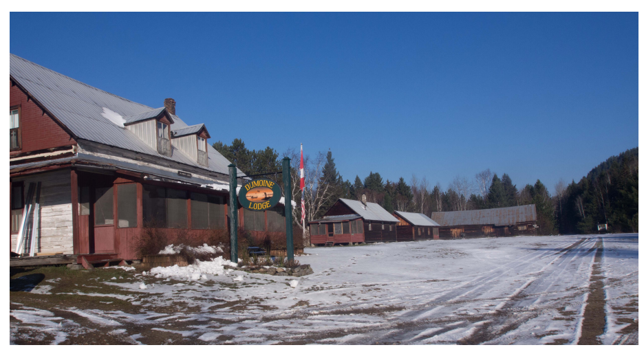
Late fall at the Dumoine Club